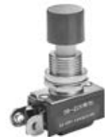
Changes for SB Pushbuttons

I. The location of production will change for specific SB Pushbuttons from the Japan factory to the Philippines factory. The place of manufacture will no longer appear on the bottom of switches, and the lot number on the switch case will have a dot mark above the second digit. The box in which the switches are packaged for shipping will read "PHILIPPINES FACTORY" instead of "JAPAN FACTORY." All of these modifications will apply to standard, custom and UL/CSA approved products.