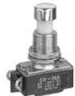
Changes for SB Pushbuttons

2. SB Pushbuttons with UL approval will have a change on the switch case to include both standard and custom devices. Previously, the UL symbol appeared on the case without a factory code. After the change, the code 080 will appear next to the UL symbol. The table illustrates the difference.